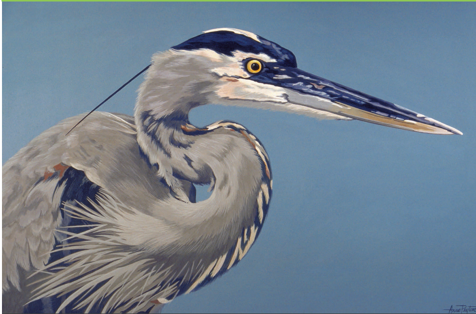
Anne Peyton, Big Blue , acrylic painting www.annepeyton.com