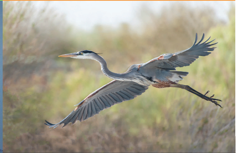
Nathaniel Smalley, Full Flight - Great Blue , photograph www.nathanielsmalley.com