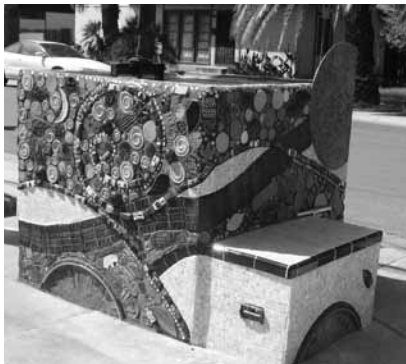
Farmer and 11th St. irrigation standpipe

Further down Eighth Street, south of University Drive, is Creamery Park. Built in 1999, the park was named to recognize the creamery's impact on Tempe.