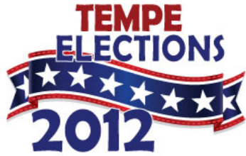
Exhibit A to City of Tempe Resolution No. 2012.66