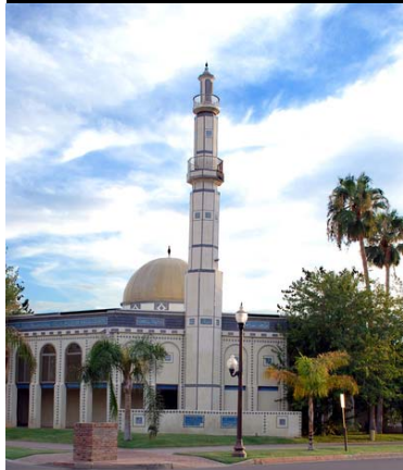
Tempe Mosque (Islamic Community Center)

Have you ever been in downtown Tempe and heard the call to prayer emanating from the sparkling white and blue-tiled Tempe Mosque at Sixth and Forest. Tempe has a significant Muslim population whose diversity, contributions, and presence enrich the community. In order to promote cultural appreciation and interfaith respect of Muslim citizens, the Tempe Historical Museum, in collaboration with Arizona State University, the City of Tempe Diversity Office and the Tempe Muslim community, will present Jewel in the Desert . This project will collect life stories, oral histories and artifacts reflecting the history and experiences of Arizona Muslims.