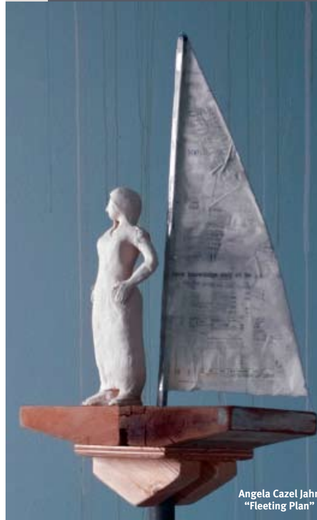
Angela Cazel Jahn "Fleeting Plan"